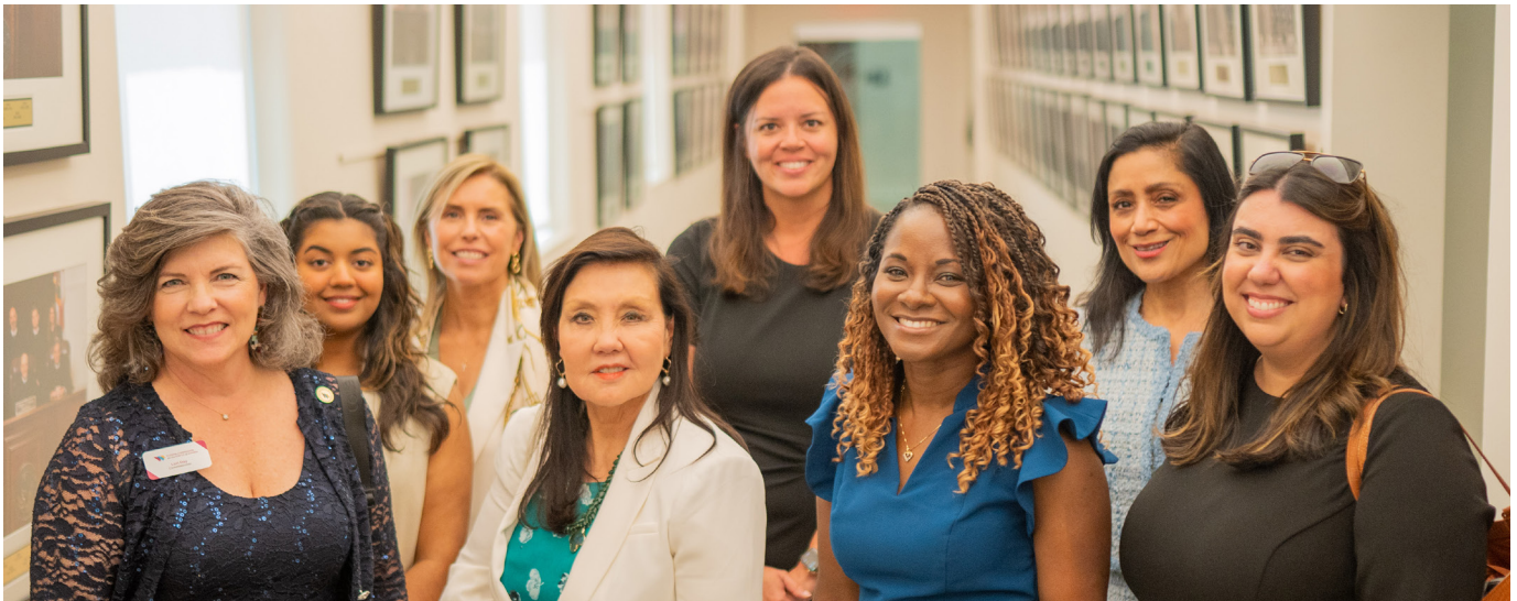
2025 FCSW Installation of Officers

The Florida Commission on the Status of Women (FCSW) proudly reflects on a year marked by progress, partnership, and purpose. Throughout 2025, the Commission continued its commitment to amplifying women's voices and promoting opportunities to strengthen Florida's communities. From data collection and statewide outreach to meaningful collaborations and recognition of exceptional women, this year showcased the power of community and dedication to the Commission's mission. Together, we celebrate the strides made toward a brighter, more prosperous future for all Floridians.