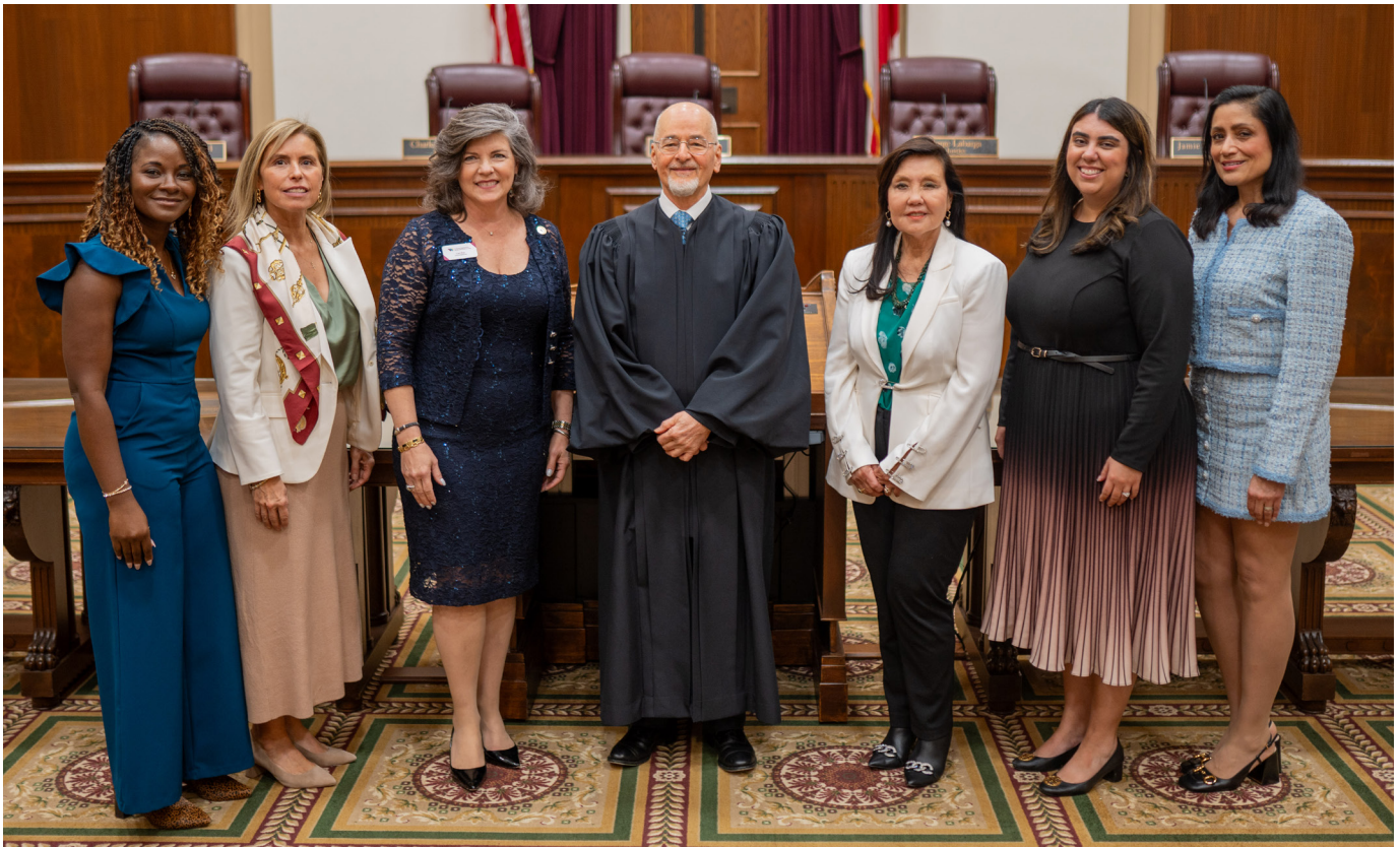
2025 FCSW Officers with Supreme Court Justice Charles Canady

A State where women and families are empowered, have opportunities to thrive, and contribute to building a more prosperous Florida.