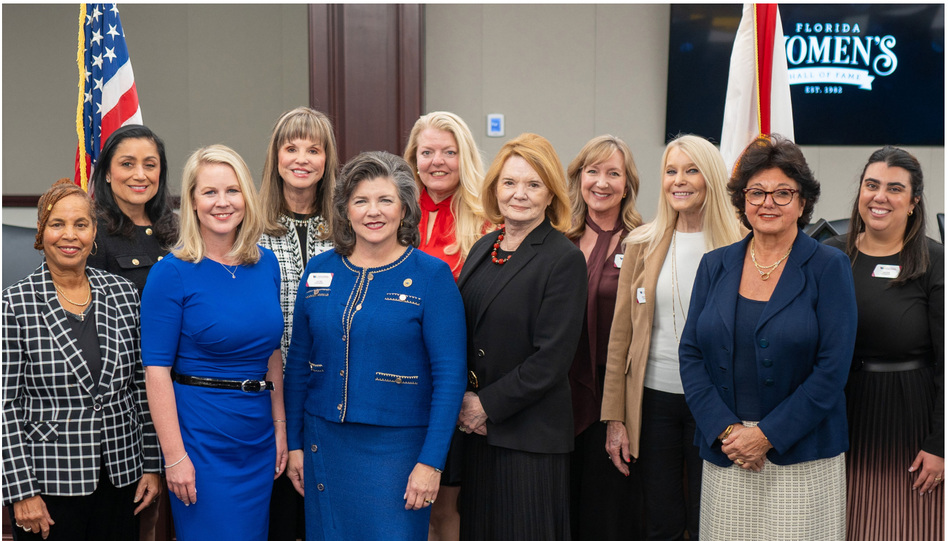
2025 Florida Women's Hall of Fame Ceremony — Current and Former FCSW Commissioners

As 2025 ends, the Florida Commission on the Status of Women proudly reflects on a year defined by collaboration, research, and celebration. Through statewide partnerships, educational initiatives, and recognition of women's achievements, the Commission continued to advance its mission of amplifying women's voices and promoting opportunity for all Floridians. From uniting local commissions and community leaders to expanding research that informs policy and elevates understanding, FCSW strengthened its role as a catalyst for progress. The year's accomplishments—including the Voices of Florida Women surveys, the Virtual Veterans Summit , and the Florida Women's Hall of Fame—demonstrate the collective power of leadership and service in shaping a stronger, more equitable future. With gratitude for the dedication of its commissioners, partners, and supporters, the FCSW looks ahead to building on this momentum in 2026 and beyond.