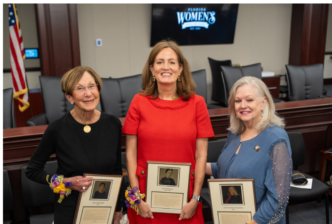
2024 Florida Women's Hall of Fame Inductees