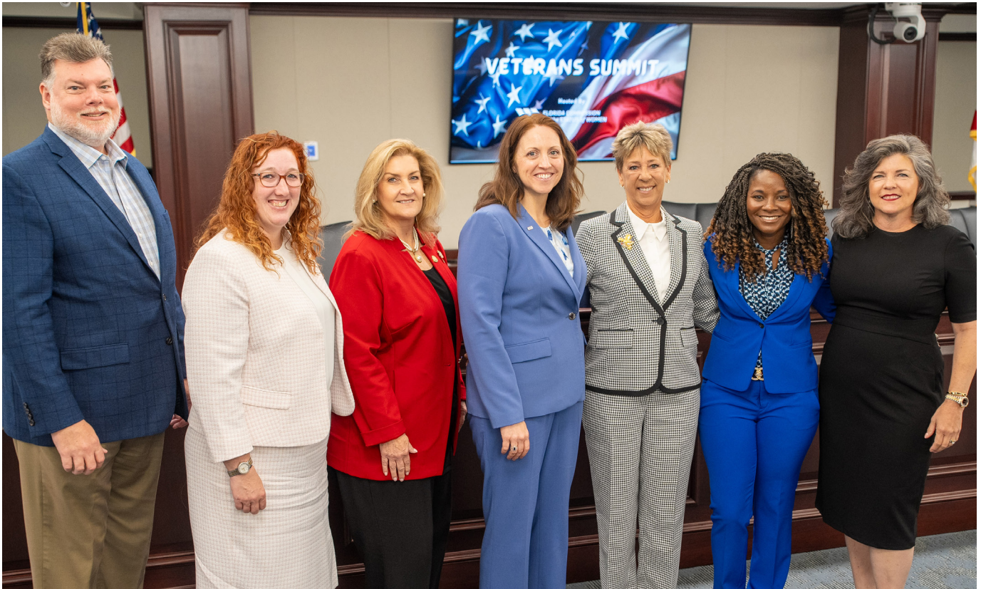
2025 Veterans Summit Panelists

https://fcswnet/virtual-florida-veterans-summit/